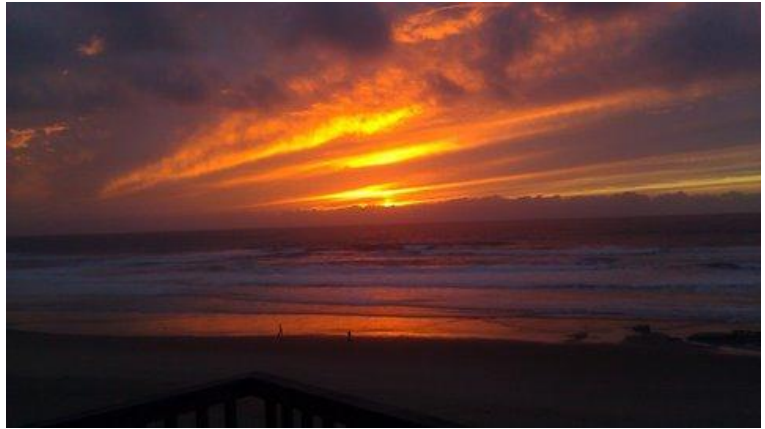
Just another ho-hum beach Sunset