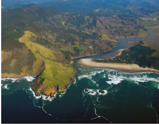
Gathering Site - Enthralling Estuary on the Pacific

“Dancing with the paradox of a world on the brink of ruin or... renaissance!”