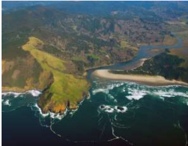
Gathering Site - Enthralling Estuary on the Pacific

“Dancing with the paradox of a world on the brink of ruin or... renaissance!”